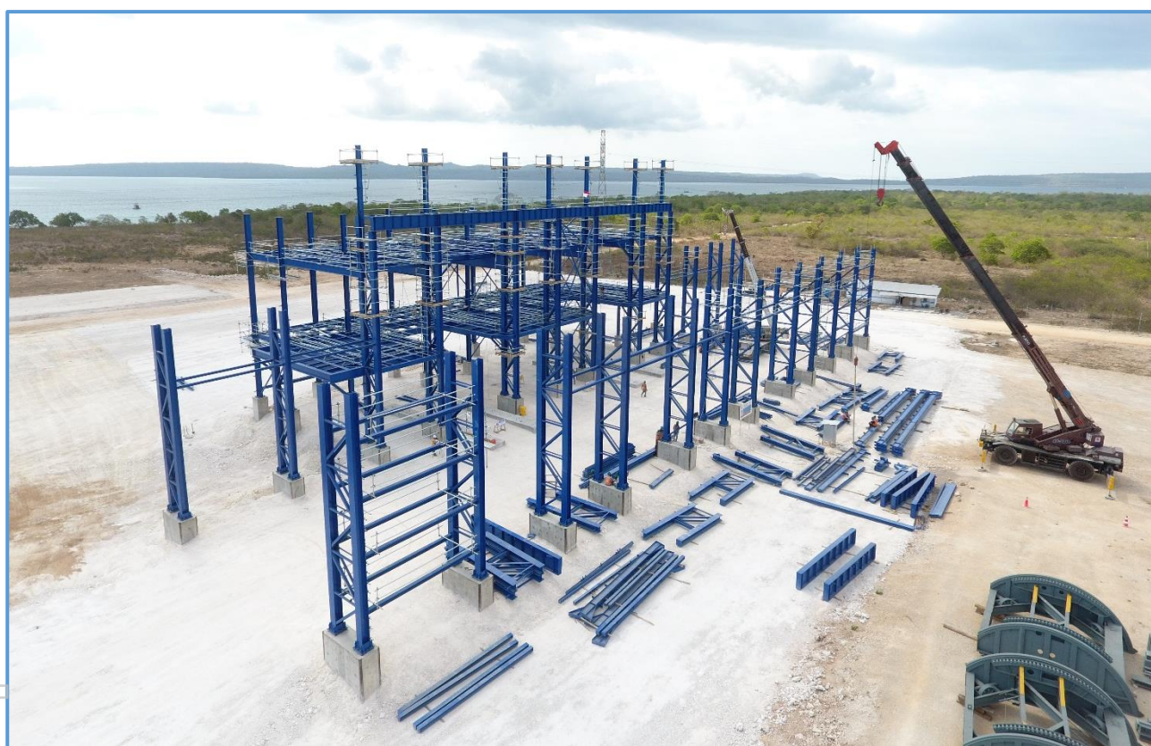
Figure 1: Latest development progress at the Kupang Smelting Hub Facility

10 August, 2018: Smelter reassembly and installation commences onsite at Kupang, including the establishment of PT Weltes site infrastructure (site office, workshop and tool store);