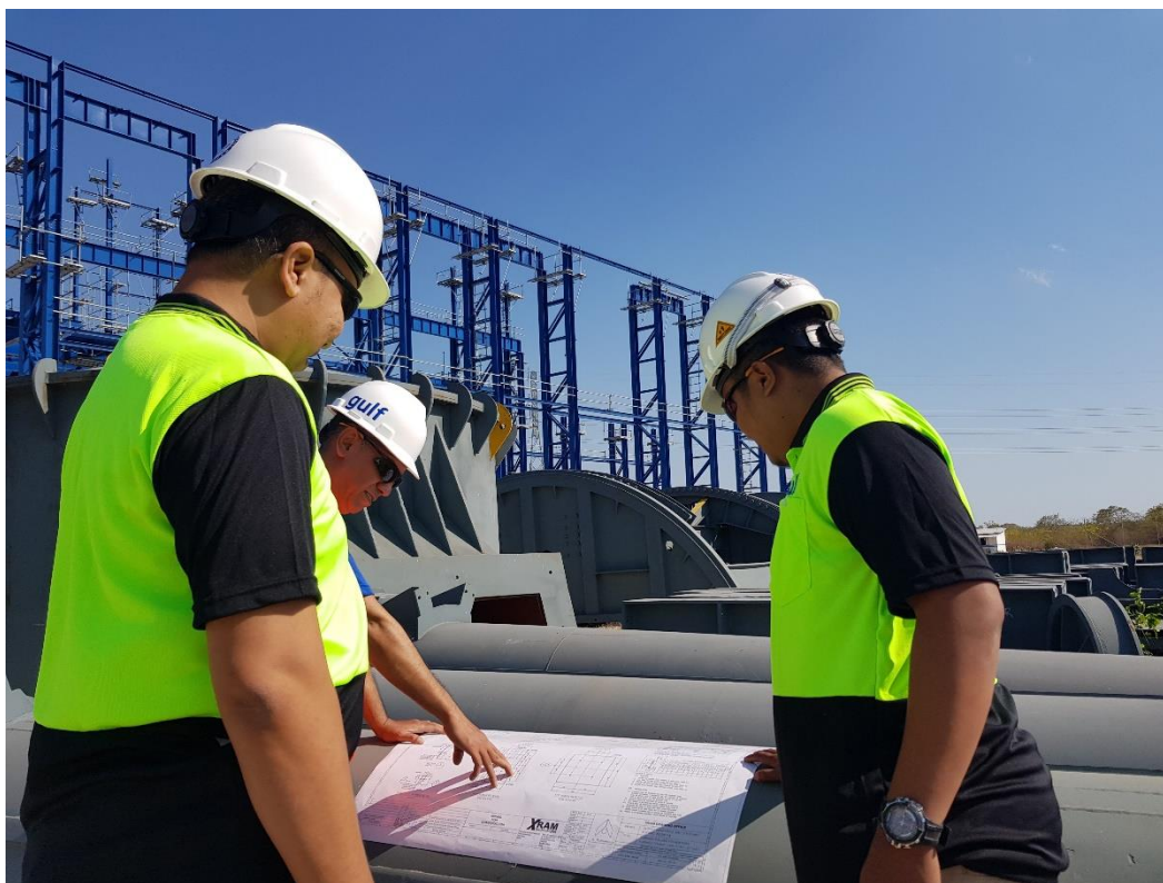
Figure 2: Smelters and Construction Site – Kupang Smelting Hub at Bolok Industrial Estate