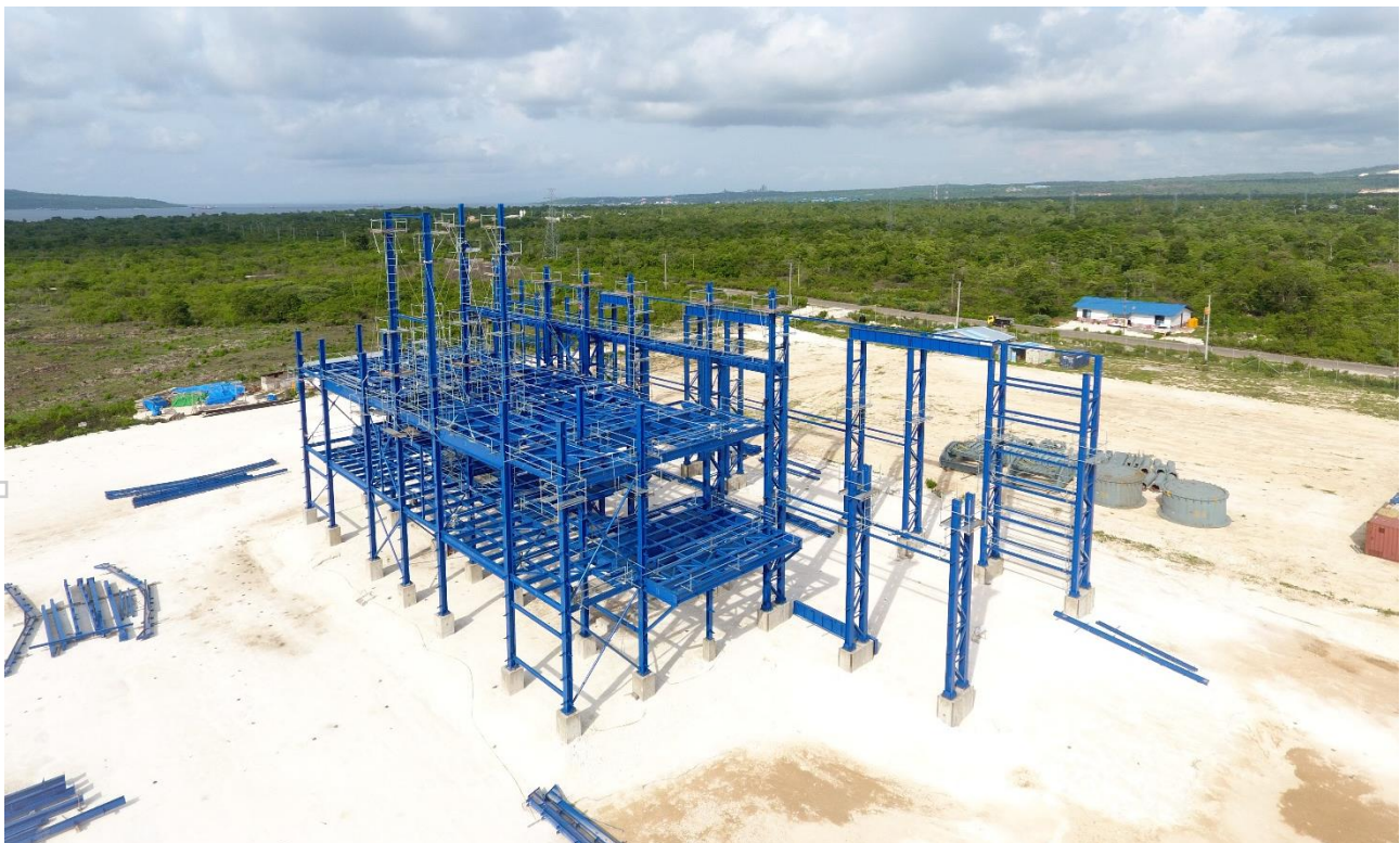
Figure 1: Kupang Smelter Hub Construction Site

During the year in focus, the Company made the decision to scale back construction activities while extra emphasis was placed on securing the requisite funding to finish construction. In addition, the Company has also ramped up its efforts to lock away diversified supply channels of high-grade ore to underpin future production.